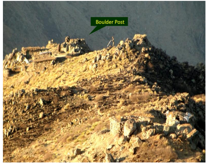
Figure – 1